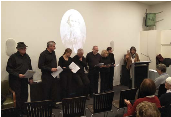
Members of Richmond Players.